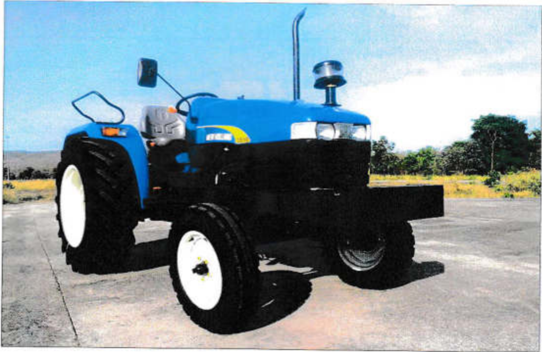
NEW HOLLAND 3510 TRACTOR