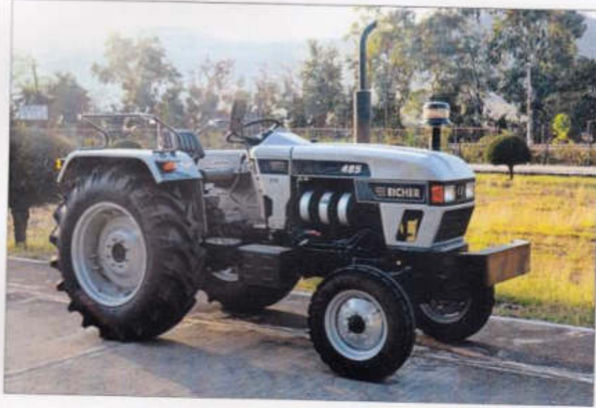
EICHER, EICHER 485 USJ TRACTOR

संख्या / No. : T-1517/2044/2021 माह / Month : February, 2021